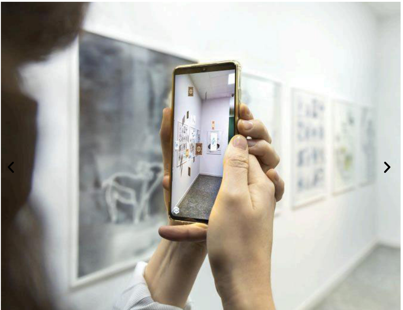
Kennedy+Swan, A Closed Mouth Gathers No Feet , 2019, Series of 10 augmented watercolour print x 70 cm (each).

The Continuum Project is the most recognised series by Krista Kim. It overtook Times Square in 2022, as part of the Times Square Arts commission, turning an advertisement-filled space into a meditation zone. One of the three long Continuum pieces is in the permanent collection of LACMA Museum in Los Angeles.