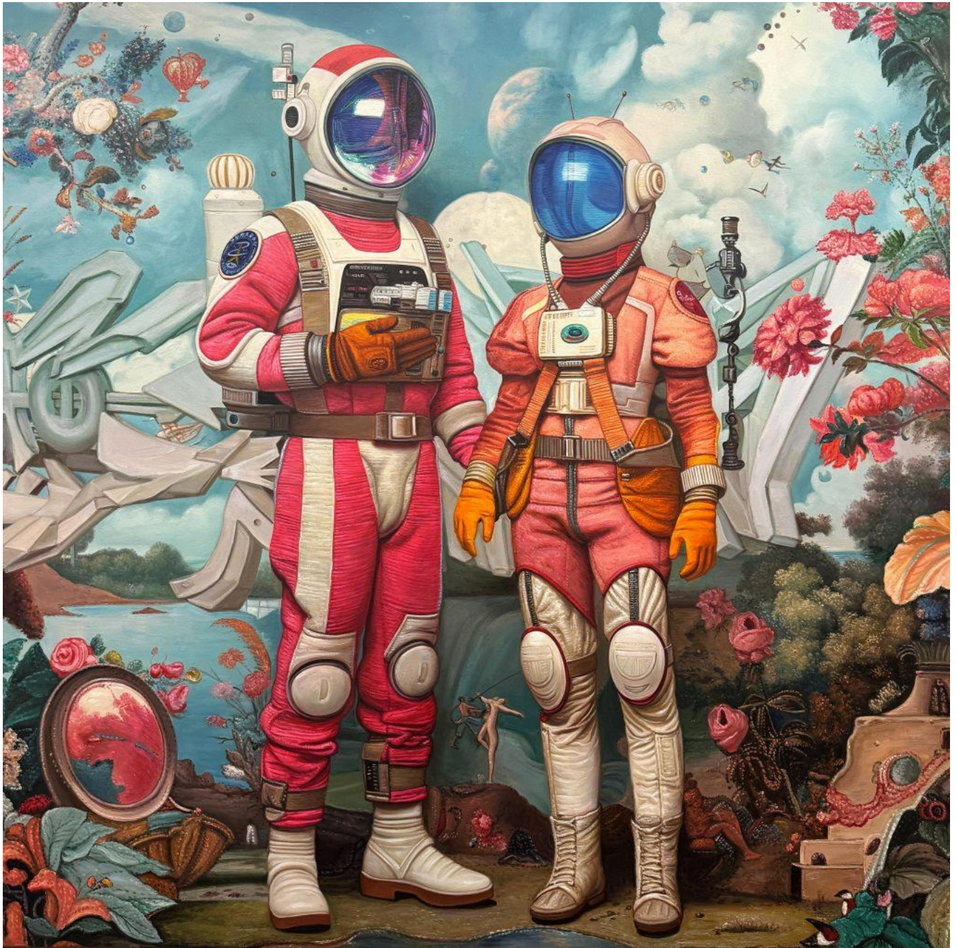
Jahan Loh, 碧山星:: KEPLER-1649C, 2024, mixed media on canvas, 126cm x 126cm.

The Columns Gallery (Seoul, Singapore) will present Meet Eva Here , a social experiment and performance artwork that explores the complex and evolving relationships between humans and AI companions. The artwork is featured as part of the PLATFORM sector of ART SG. Visitors to ART SG will be able to engage with Eva, the interactive chatbot with a 3D virtual character. Acting as a social experiment and a mirror to society, Meet Eva Here invites us to reflect on our connection and trust with artificial intelligence.