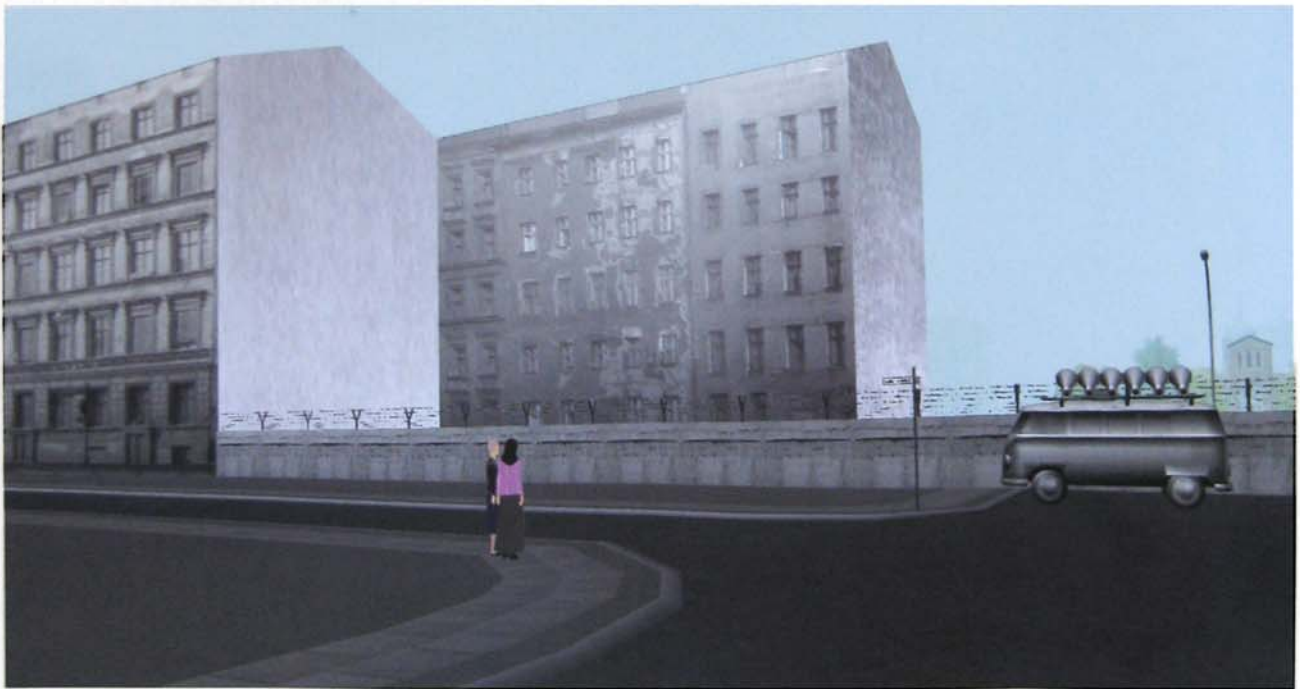
TAMIKO THIEL/ TERESA REUTER, GER Installation Virtual Wall , 2008 Screenshot