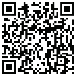
Venice Biennial 2011 AR Intervention Cyberartist Group Manifest.AR